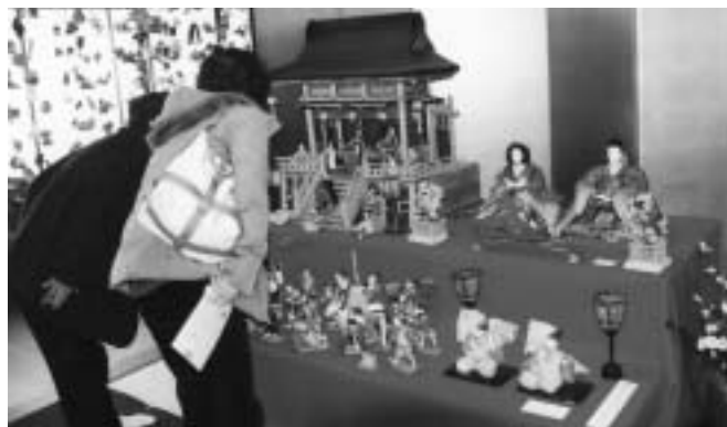
Last Year’s Hina Matsuri, Futagawa Shuku Honjin

Koto Performance - Sun., Mar. 8, 2 PM: Students from Futagawa Minami Elementary will put on a koto (Japanese harp) performance.