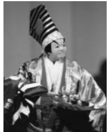
From the play Ninin Sanbasou

Bunraku is a world-famous, sophisticated theatrical art performance and world intangible cultural asset combining chanting narrators, shamisen music, and large puppets. Enjoy a performance led by the best-designated Living National Treasures of Japan, Bunjaku Yoshida and Kanji Tsurusawa. WHEN: Sun., Mar. 8; Daytime session begins at 1:30 PM, Evening session at 6 PM WHERE: Shimin Bunka Kaikan Public Culture Hall (Mukaiyama Ooike-cho) COST: A-seats: ¥4,000; B-seats: ¥3,500; B-seats for high school students and under: ¥1,000. All assigned seating. Adult ticket prices will be raised by ¥500 on the day of performance. TICKETS: On sale at Toyohashi Cultural Foundation office at the Public Culture Hall, Life Port Toyohashi General Information Office, Toyohashi Maruei, Kalmia Service Center inside Toyohashi Station, Orient Music Toyohashi, Ticket Peer (TEL 0570-02-9999, P code: 391-091), and at City Hall Information Center (B1 Floor) INFO: Toyohashi Cultural Foundation office at the Public Culture Hall (TEL 61-6145, in Japanese only)