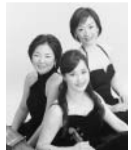
Piano Trio Musee