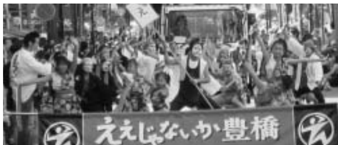
Streets overflowing with colorful costumes

Sculptures made by Toyohashi elementary and middle school children will go on display all in one building.