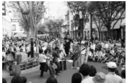
Street Performer, 2007

Inquiries: Machinaka Festival Committee ( Machinaka Festival Jikkô linkai, Inside Yamasan Gomu , TEL: 52-3901), Commerce & Tourism Division ( Shôgyô Kankô Ka , TEL: 51-2425), Downtown Planning Division ( Toshin Kassei Ka , TEL: 55-8101)